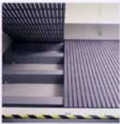
■ Fiberglass floor grating