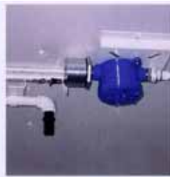
■ Dry chemical nozzle, fusible link and gas sensor module