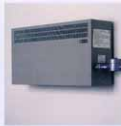
■ Explosion-proof convection heating