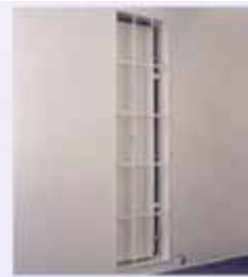
■ Explosion vent panel