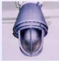
■ Explosion-proof lighting